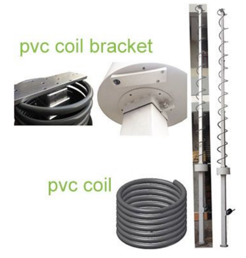
5.\,3 Mast pvc coil(NY coil) solution for cable application.